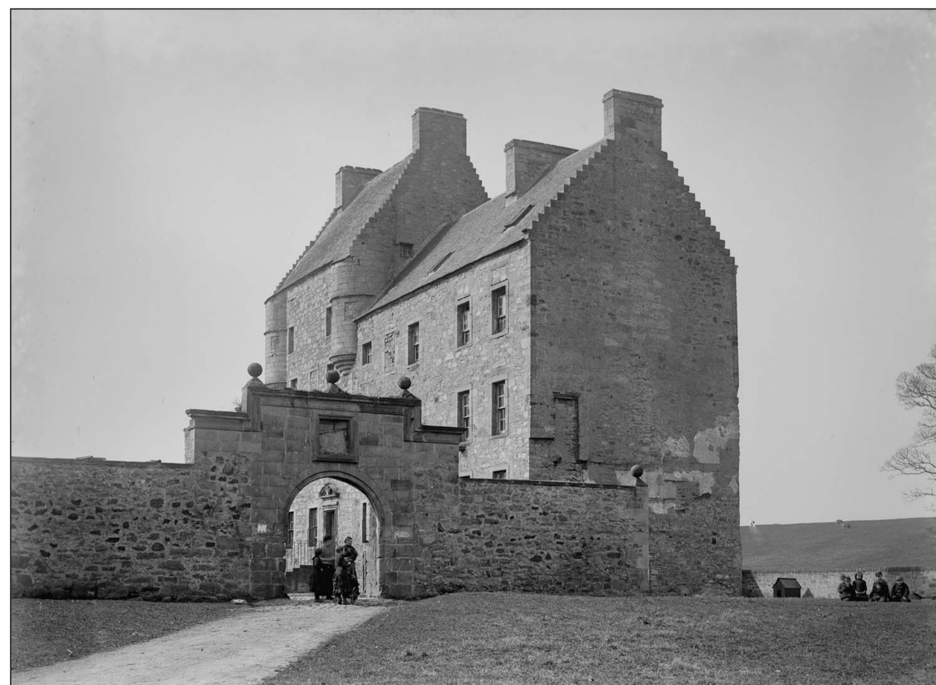
Historic photograph showing view from South East (c. 1885) © Historic Environment Scotland (John Fleming Collection).

1710 - Sir Robert Sibbald described 'Meidhope' as a 'fine tower house with excellent gardens, one of the seats of the Earls of Hopetoun'.