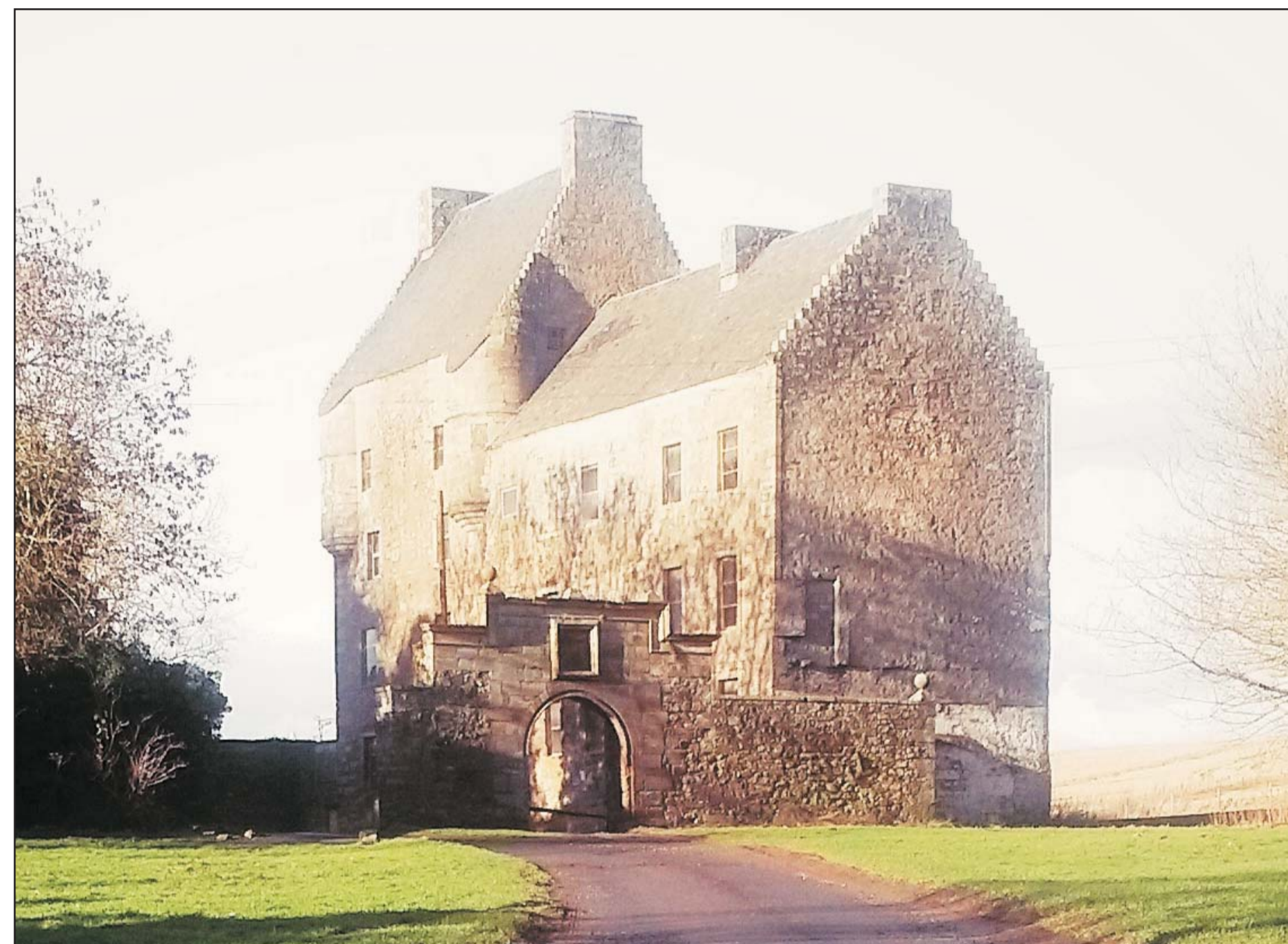
Midhope Castle in the 21st Century (2016)

1678 - The castle was acquired by John Hope and given a facelift when an entrance tower was removed and the extension to the east was heightened and extended. A new doorway was added along with a small courtyard.